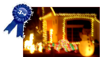
788 Morelos Street

Please note the following criteria for disqualification in contest: (1) rental properties; (2) assessment accounts not in good standing; and (3) lights not displayed during judging which took place on December 19, 2010.